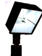
1000 W Metal Halide Powerflood Shoebox