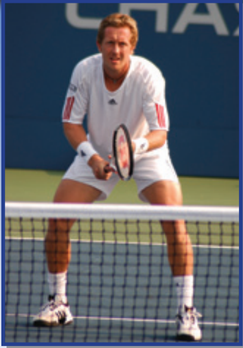
Jonas Bjorkman 2002-2004 Doubles Wimbledon Champion & Flex Court Owner